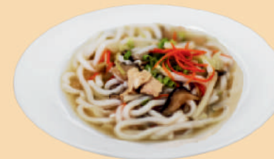
香菇鸡浓汤乌冬面 CHICKEN MUSHROOM UDON