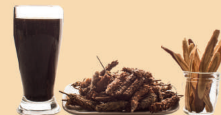
下火草 HA FOR CAO

Strengthens the blood and calms the mind. Effective for forgetfulness and dizziness.