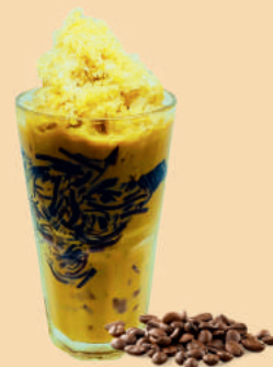
白咖草悠然冰 KOPI-PUTEH CINCAU