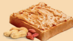
花生醇香 PEANUT BUTTER