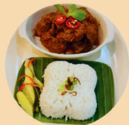
仁当牛肉饭 BEEF RENDANG Served with flavoured rice and cucumber pickles