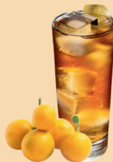
金桔暖心冰 KUMQUAT ICED FRUIT TEA