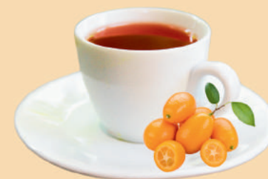
金桔暖心飲 KUMQUAT FRUIT TEA