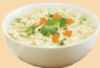
鸡汤肉片通心粉 MACARONI SOUP With thin sliced chicken breast & diced carrot