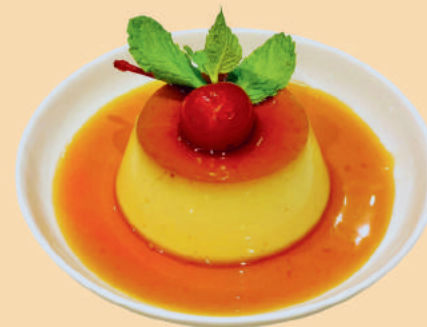
焦糖雞蛋布甸 CRÈME CARAMEL