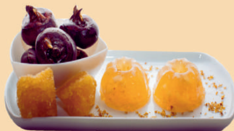
桂花马蹄糕 OSMANTHUS WATER CHESTNUT CAKE