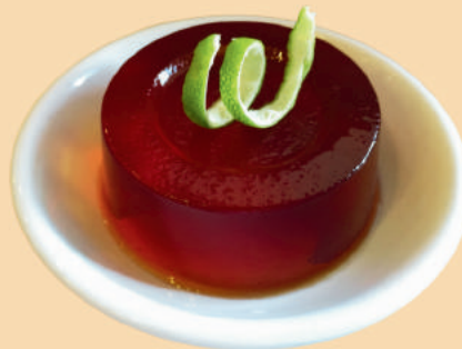
伯爵茶果冻 EARL GREY JELLY