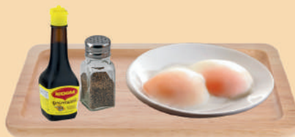
生熟蛋 HALF BOILED EGGS