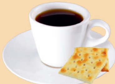
道地黑咖啡 BLACK COFFEE