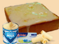
牛油炼乳 BUTTER CONDENSED MILK