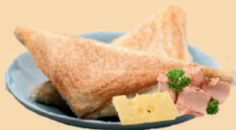
芝士吞拿鱼 CHEESY TUNA