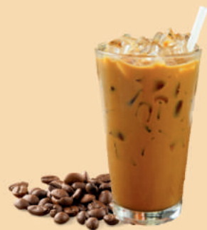
特色白咖啡冰 ICED WHITE COFFEE