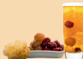
雪耳龙眼 WHITE FUNGUS WITH LONGAN

Relieves infections and inflammations of digestive tract, mouth gums and bladder.