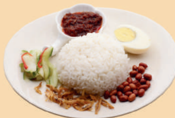
风味椰香饭 NASI LEMAK