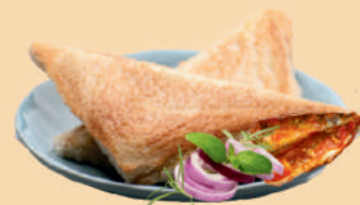
葱爆沙丁鱼 ONIONY SARDINE