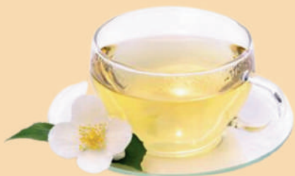
茉莉花茶 JASMINE TEA