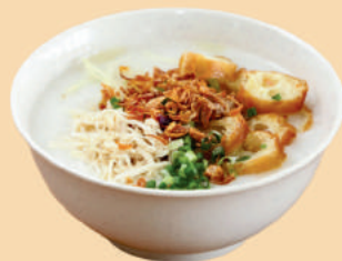
脆皮油条咸蛋鸡粥 CHICKEN CONGEE With salted egg & crisp crullers