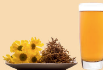
银菊花茶 CRYSANTHEMUM TEA

Relieves heat and clear toxins. Good for sore throat, fever and thirst.