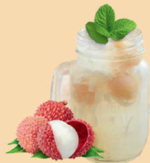
荔枝冰爽 LYCHEE CRUSH