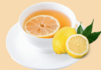
檸檬紅茶 LEMON BLACK TEA