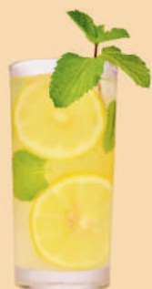
清爽柠檬冰 ICED LEMONADE