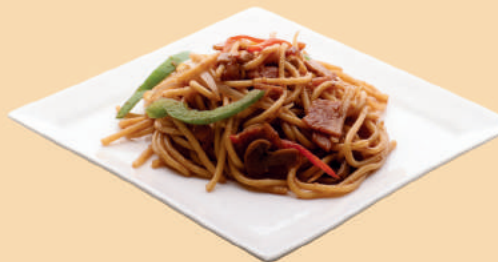
锅仔炒广式意粉 WOK-TOSSED CANTONESE PASTA