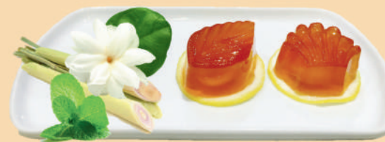
茉莉香茅果冻 JASMINE LEMONGRASS JELLY