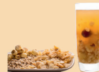
清补凉 CHENG PU LIONG

Good for cold with fever, headache & red or itchy eyes.