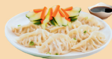
韭菜鸡肉饺子 CHIVE CHICKEN DUMPLING