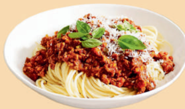
番茄鸡肉酱意粉 CHICKEN BOLOGNESE PASTA Homemade meat sauce