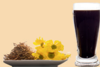
五花茶 FIVE HERBS TEA

Relieves heat and clear toxins. Good for sore throat, fever and thirst.