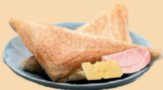
芝士鸡火腿 CHEDDAR CHICKEN HAM