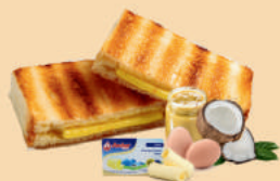
夹心咖椰牛油 KAYA BUTTER