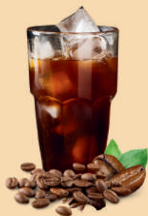
道地黑咖啡冰 ICED BLACK COFFEE