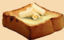
香滑牛油糖 BUTTER SUGAR