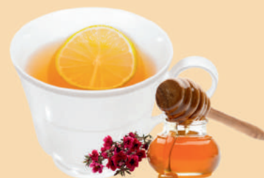
蜜糖檸檬暖飲 HONEY LEMON