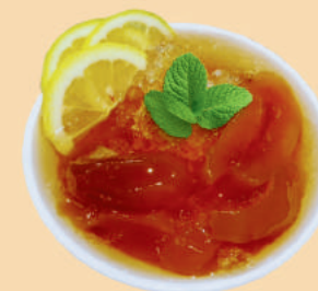
柠檬海底椰碎冰 CRUSHED ICE SEA COCONUT WITH LEMON