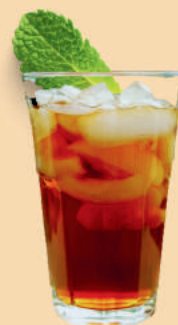
冰香紅茶 ICED BLACK TEA