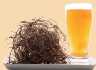
鸡骨草 JIGU CAO

Enriches the fluids of the lungs and stomach. For dry cough, thirst and feelings of hunger.