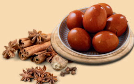
茶叶蛋 CHA YA DAN