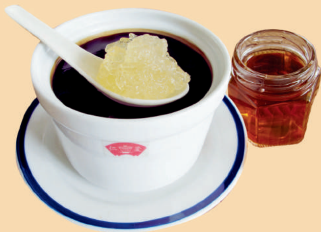
燕窩龜苓膏 HERBAL JELLY WITH BIRD'S NEST