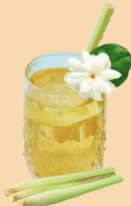
茉莉花香茅冰茶 LEMONGRASS ICED JASMINE TEA