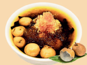
仙草猫眼冰 AIR MATA KUCING CINCAU