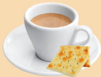
特色白咖啡 WHITE COFFEE