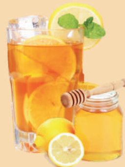
蜂蜜柠檬冰 ICED HONEY LEMON