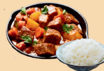
红烧牛肉土豆饭 STEW BEEF Served with flavoured rice