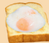
阳光吐司 SUNRISE ON A TOAST