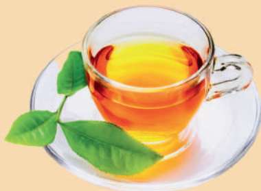
紅茶 BLACK TEA