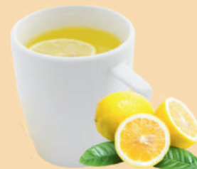
絲甜檸檬飲 TANGY LEMON