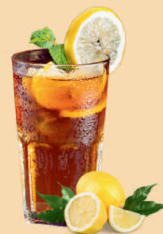
冻柠檬茶 ICED LEMON TEA