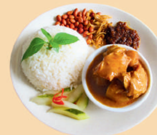
咖喱鸡香椰浆饭 NASI LEMAK WITH CURRY CHICKEN