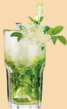
接骨木花蘇打冰 ELDERFLOWER SMASH