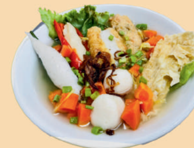
缤纷酿什料 MIXED YONG CHAP