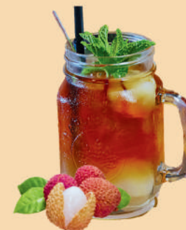
荔枝柠檬冰 LYCHEE ICED LEMON TEA